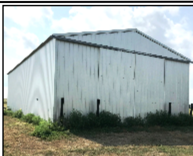
POLE SHED (TO BE MOVED)

(2) JD 8-12 Hoe Drills 3-Pt. Post Hole Auger (2) One-ways Dump Rake, Graham Hoeme JD 14' Mower 3x5 V-Blade Portable Loading Chute Cattle Working Chute