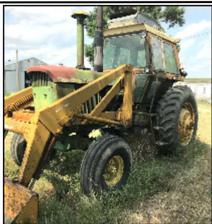
TRACTORS, VEHICLE & HAY EQUIPMENT

LOCATION: FROM BEELER, KS—GO 8½ MILES SOUTH