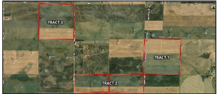
480 ACRES GRAY COUNTY LAND – (3) INDIVIDUAL TRACTS (NO COMBINATION) (Sells at 11:00 a.m. – No Earlier)